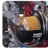
Sectioned Oil filter