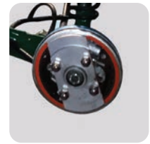
Sectioned Rear Wheel